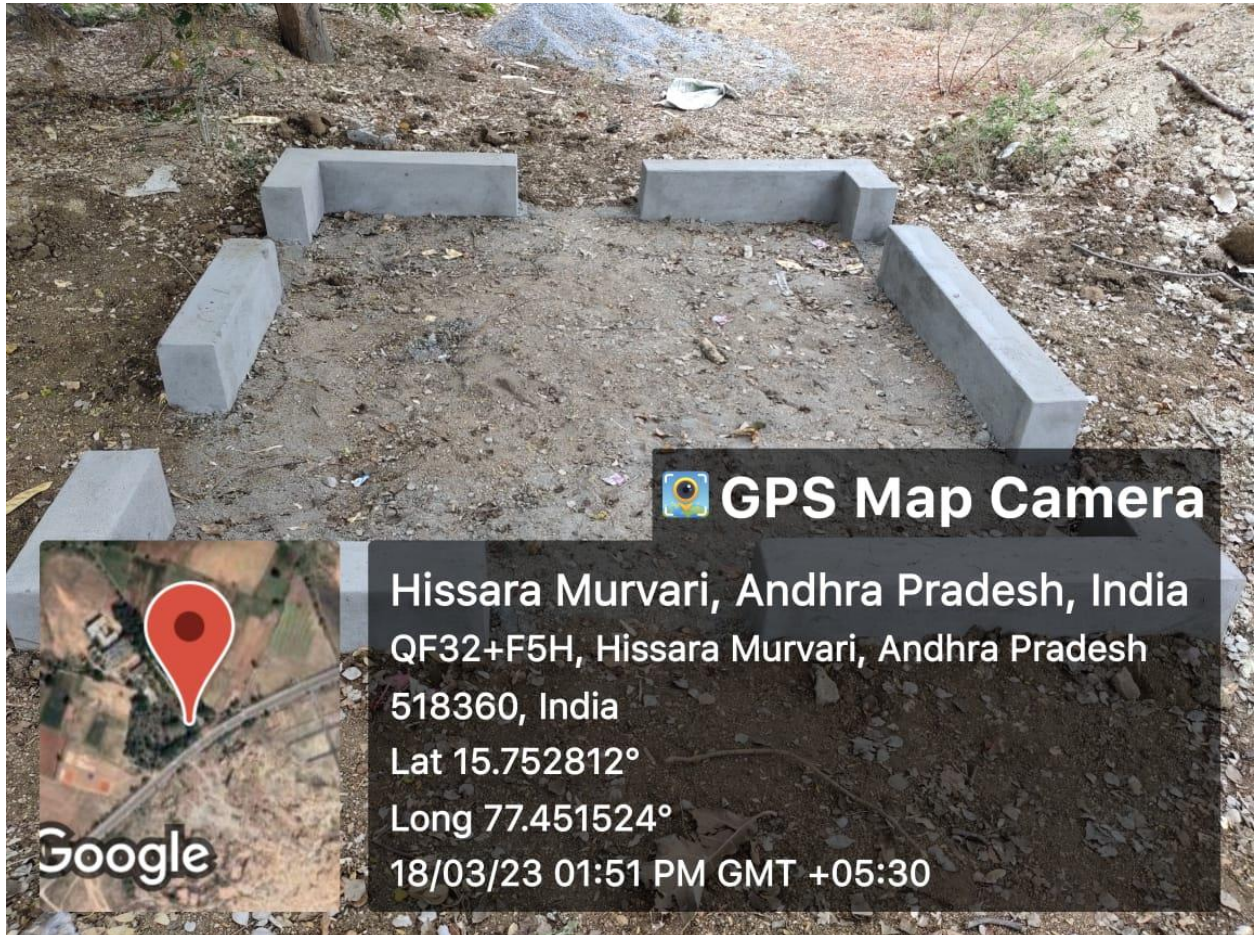
RAINWATER HARVESTING PIT